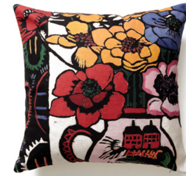
Margaret Preston cushion covers

Exclusive to the Gallery Shop, our Margaret Preston cushion cover collection features floral prints drawn from the Art Gallery's rich collection of Australian art. Made from 100% organic cotton, each design features details of an iconic Preston print. Covers measure 45 x 45 cm, have invisible zip closures and are designed and made in Australia.