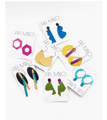
Fifi Milo jewellery

Exclusive to the Gallery Shop, our Margaret Preston cushion cover collection features floral prints drawn from the Art Gallery's rich collection of Australian art. Made from 100% organic cotton, each design features details of an iconic Preston print. Covers measure 45 x 45 cm, have invisible zip closures and are designed and made in Australia.