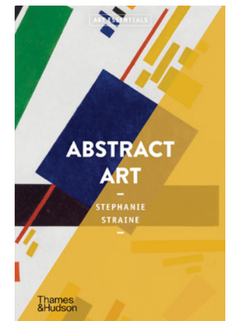
Abstract Art (Art Essentials) , Stephanie Straine, Thames & Hudson Australia, paperback, RRP $22, members $19.80

Explore abstraction further with this lively introduction, tracing art movements from the early 1900s right up to the present day via a veritable hit-parade of well-known pioneers and lesser-known groundbreakers. This guide takes a fresh approach to one of modern and contemporary art's most vital forces.