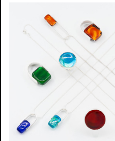
Olivia Raymond Designs

Featuring bold colours and quirky shapes, Fifi Milo crafts wearable works of art that are designed to bring joy to the wearer. Taking inspiration from geometry and abstraction, Fifi Milo designs are made from 100% recycled aluminium and sterling silver. Striking enough to make a statement, yet lightweight enough for everyday wear.