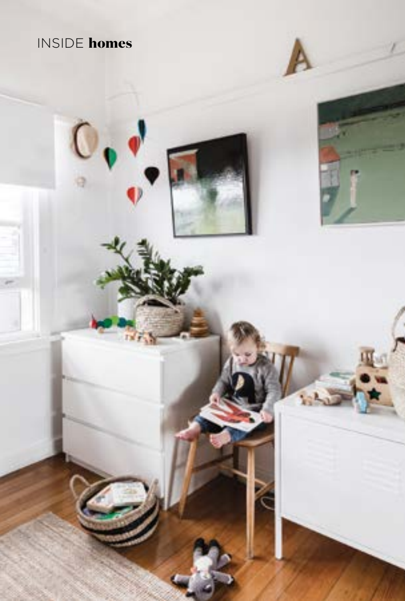
BEDROOM (left) Ash has plenty of room to grow and lots of storage with the IKEA drawers and metal cabinet (left). The artworks are (left) Outside The Ladies and Derek Spots A Bat , both by Vanessa Stockard. DINING AREA (below) Detail of the customised Nomi 'Time' oak dining table. LIVING AREA (opposite) Beside the sofa is a vintage bentwood table with a custom marble top. "My great-uncle made the round ceramic vase on it," says Amber. The eye-catching horn table lamp is from Orient House.